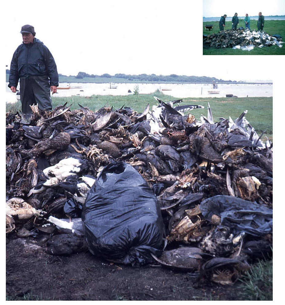
Photo 1. A pile of dead Eiders (mostly females) which succumbed during the epizootic caused by avian cholera in the Stavns Fjord colony in Denmark in 1996. Some gulls (to the right) have probably died from scavenging on dead Eiders.

Avian cholera may be a recurrent disease in Eiders populations in the coming years, as indicated by the striking increase in outbreak frequency since the first record in 1984, the intervals between outbreaks being 12 years, 5 and 2 years, respectively. Hypothetically, such an increase in outbreak frequency may indicate that the long-term resistance of healthy carriers may have declined, e.g., carriers