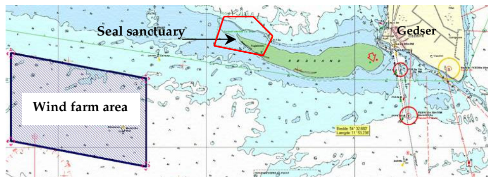
Figure 1 Map of the wind farm area and the seal sanctuary.

Nysted Offshore Wind Farm will be placed in Fehmarn Belt about 10 km south of the city Nysted (Lolland). The water depth in the wind farm area is between 5.5 m and 9.5 m. A large part of the area consists of sand bottom with larger and smaller ridges. In places there are pebbles, gravel or shells. Although there are outcrops of stones larger than 10 cm, no reef-like aggregations are known.