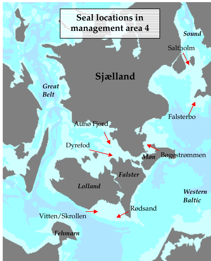
Figure 2 Map of Management area 4 (Southwestern Baltic) with area names and seal sites. Seal haulout sites are indicated with arrows.

The aerial surveys were started in March 2002 and continued until August 2002. From September 2002 through January 2003 the aerial surveys were interrupted due to lack of funding and contracts. The surveys were resumed in February 2003 and the most recent data available for this report was obtained in March 2003.